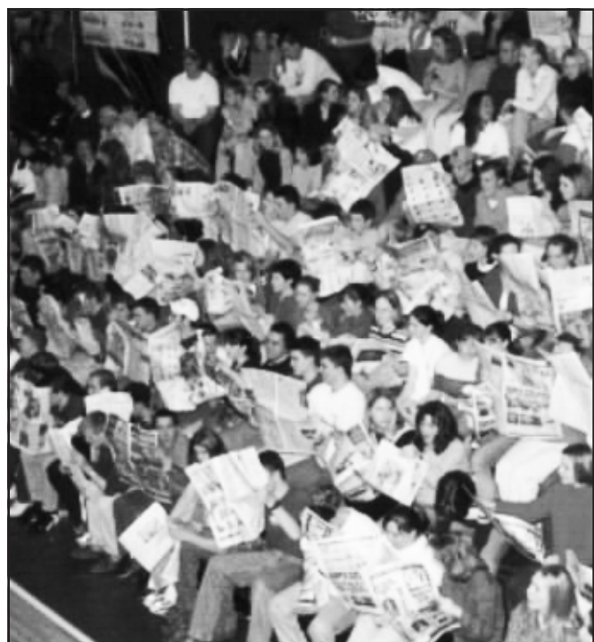
The Infamous Pit Crew read the North Georgia News during a game against Dawson County in the mid-1990s. The intent was to ignore the Panthers' opponent.