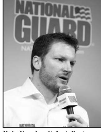
Dale Earnhardt Jr. talks to media on Jan. 23

"We've got a lot of good opportunities," Hendrick said. "The way we're positioned, the car is covered until the end of the summer. I don't have a deadline [for a deal]. I'm not