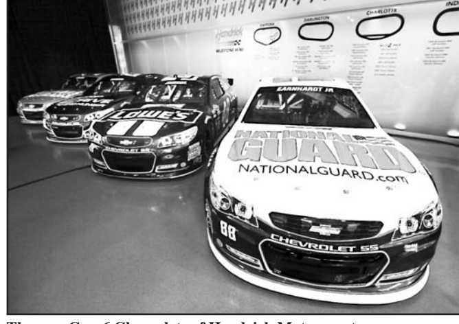
The new Gen-6 Chevrolets of Hendrick Motorsports.

"We had a car (Gen-4) that looked really similar to the manufacturer vehicle that was in the showroom," Jeff Gordon said. "We went completely away from that in every which way, from having a splitter, we had the wing, and we just had