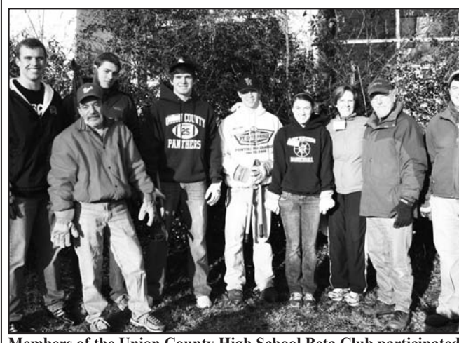
Members of the Union County High School Beta Club participated in the MLK Community Service Day.

Over 30 Union County High School Students, teachers, and administrators gathered to turn a school holiday into a community service day.