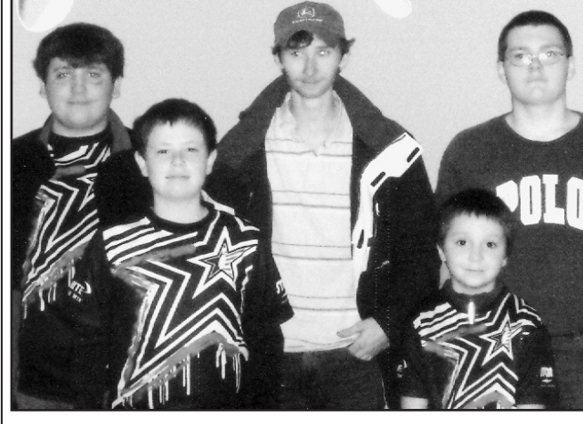
The Blairsville Bowling Youth League would like to express their gratitude towards the Huddle House of Blairsville for their donation towards the league. This will go towards competitions throughout Georgia. The Youth League meets every Saturday at 11 a.m. All ages are welcome to join us. Please contact Galaxy Bowling for information.