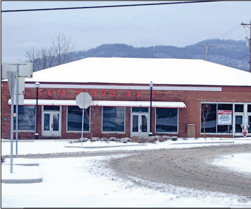
The last known photograph with the Kings 5&10 sign attached to the building was taken last Tuesday during the snowstorm.