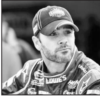
Jimmie Johnson, winner of Sunday's Martinsville Cup race

"I think it's important to stay calm and focused," said Johnson. "I have been so fortunate to not need to worry about Richmond and making the Chase and, hopefully, it stays that way."