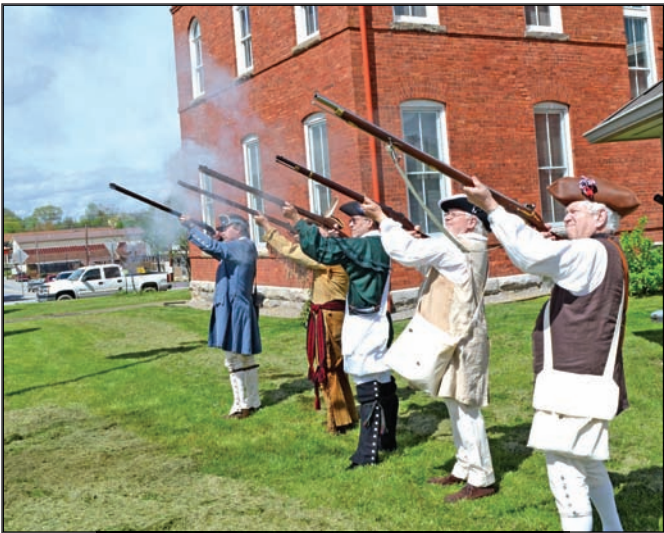
Patriots fire the traditional volley outside the Historic Union County Courthouse on Saturday.