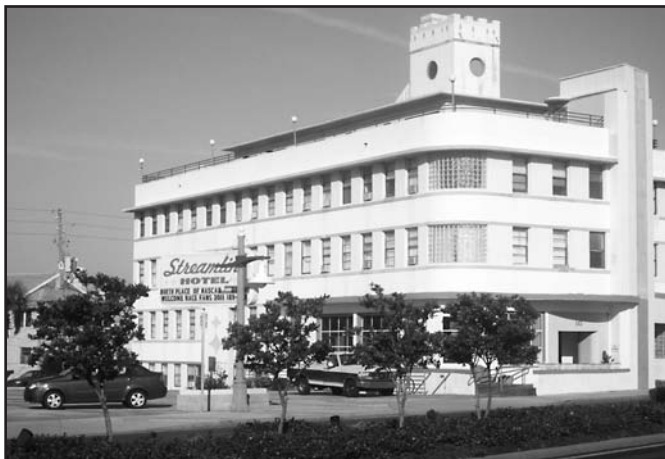
Birthplace of NASCAR, the Streamline Hotel, 2011.

with a ninth-place finish in the Daytona 500. So far, it's his only top-10 this season.