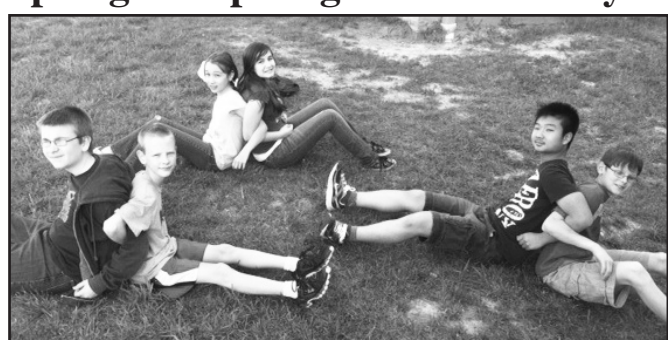
UCMS students in the afterschool program enjoy the outdoors and welcome "Spring." After working on lessons to prepare for the CRCT testing, students are ready to play and have fun in the sun! N(Apr30,Z15)CA