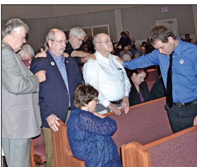
Blairsville-Union County prays for our local leaders at the National Day of Prayer event last week.