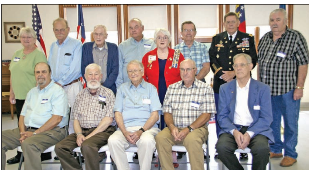
Mountain Presbyterian Church honored local Vietnam veterans on Saturday.