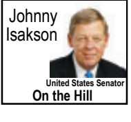
Johnny Isakson On the Hill United States Senator

The Obama administration has greatly reduced the nation's productivity by over-regulating business. I understand and support mitigating risk; however, you cannot remove all risk in a free-enterprise system. We are handicapping ourselves by regulating ourselves right out of business and jobs.