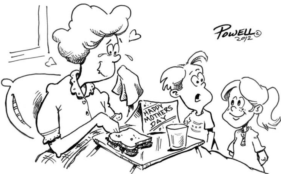
"Who would have thought moms actually like jam sandwiches?"