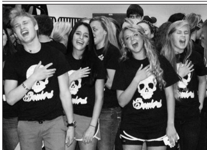
The senior class joins in on impromptu singing of the National Anthem while the winners were being announced.