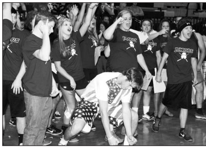
The juniors celebrate after winning an event.