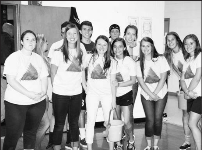
The Union County High School Annual Staff put in months of blood, sweat, and tears to publish the yearbooks that were handed out last Friday following the U-lympics.

Cornhole. The second place junior class picked up top honors in: Participation, the Spirit Week Float, Spirit Week Dress-Up, lowest library fines, Math, Spanish, Girls Free Throw Shooting, Boys Free Throw Shooting, Girls Tug-of-War, Girls Soccer Penalty Kick, Half-Mile Run, Girls Softball Throw, Girls Golf, and Girls Broad Jump, Girls Football Throw, Boys Cross-Fit