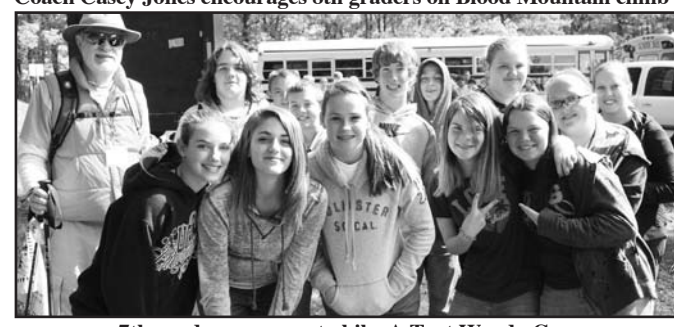
7th graders prepare to hike A.T. at Woody Gap