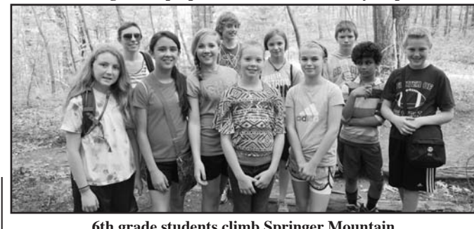
6th grade students climb Springer Mountain