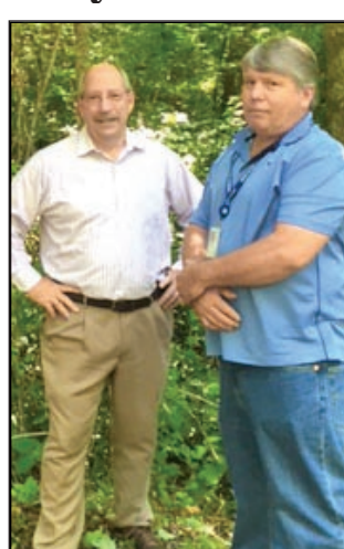
See Dam, Page 15A

Most recently, they have put in a walking trail near the dam. The trail is cur-