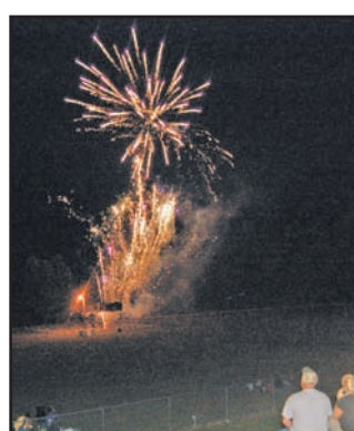
Fireworks over Suches dazzled in 2013