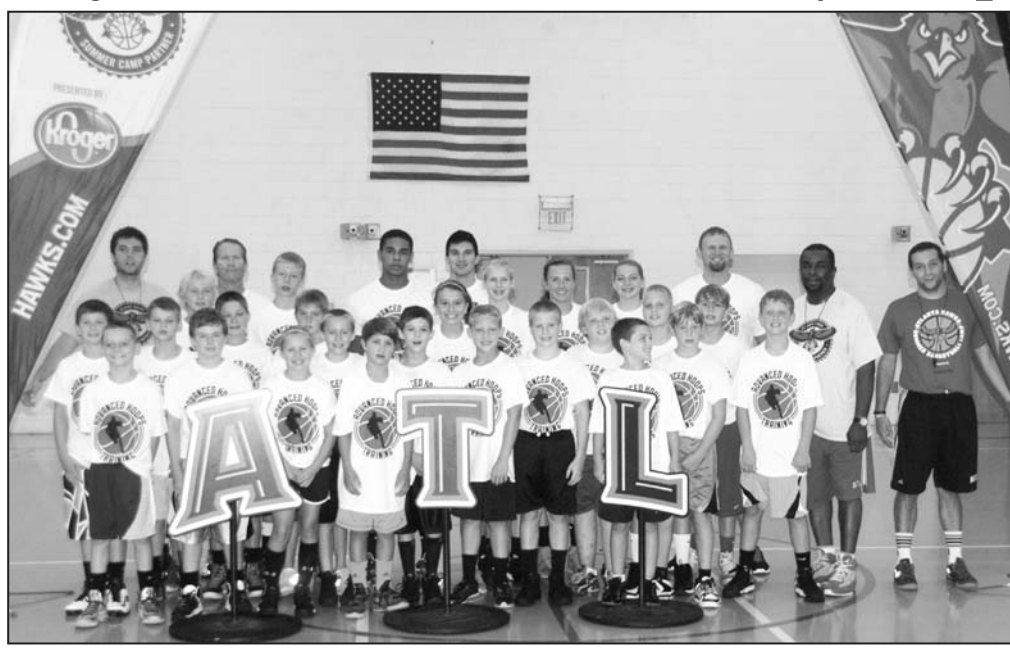
Assistants from the Atlanta Hawks Developmental Team took part in the Advanced Hoops Training (AHT) Camp in Blairsville last week.