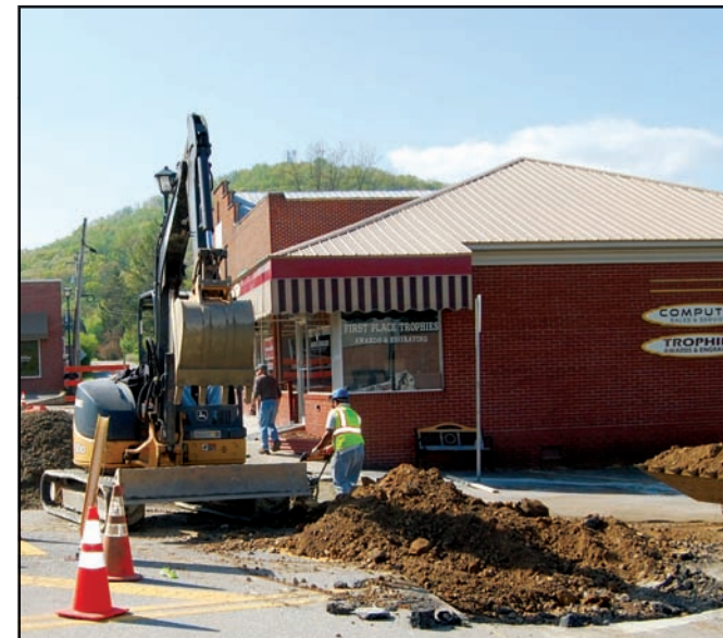
Scenes like these have made for some unhappy campers in Downtown Blairsville.