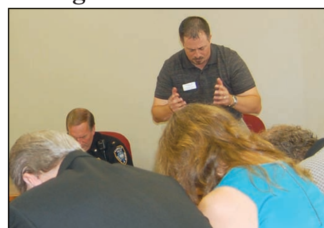
City leaders and residents from two states prayed for our nation last week at City Hall.