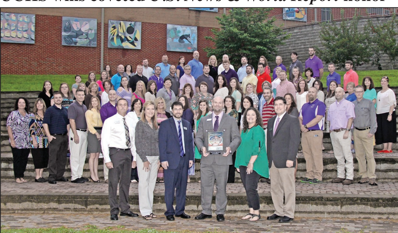
Union County High School celebrates its 2015 Bronze Award from U.S. News and World Report.