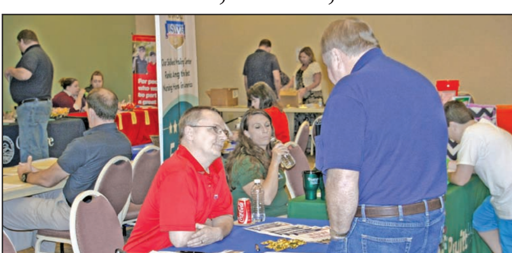
Job seekers now know that there are jobs to be had in three neighboring counties.

"We didn't have any shortage of companies that needed people - that was a