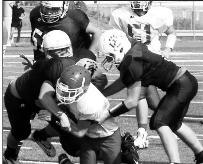
UCMS' Purple Swarm brings down a Wildcat ball carrier in last week's game.