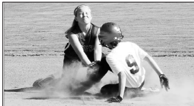
Lady Panther Middle School in action at Towns County last week.

before returning home to face Lumpkin again on Sept. 4th.