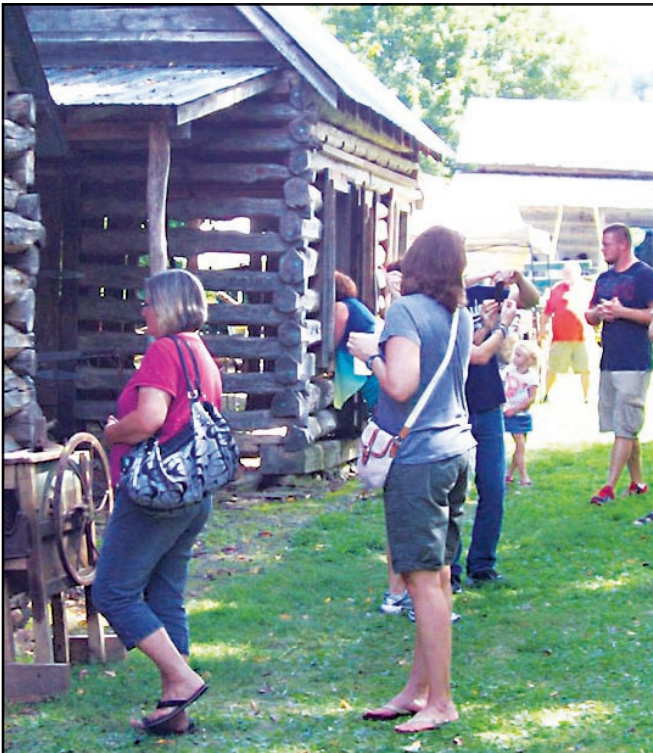
Locals and visitors alike came out Saturday and Sunday to get a glimpse of the native way of life in early Union County at the annual Heritage festival.