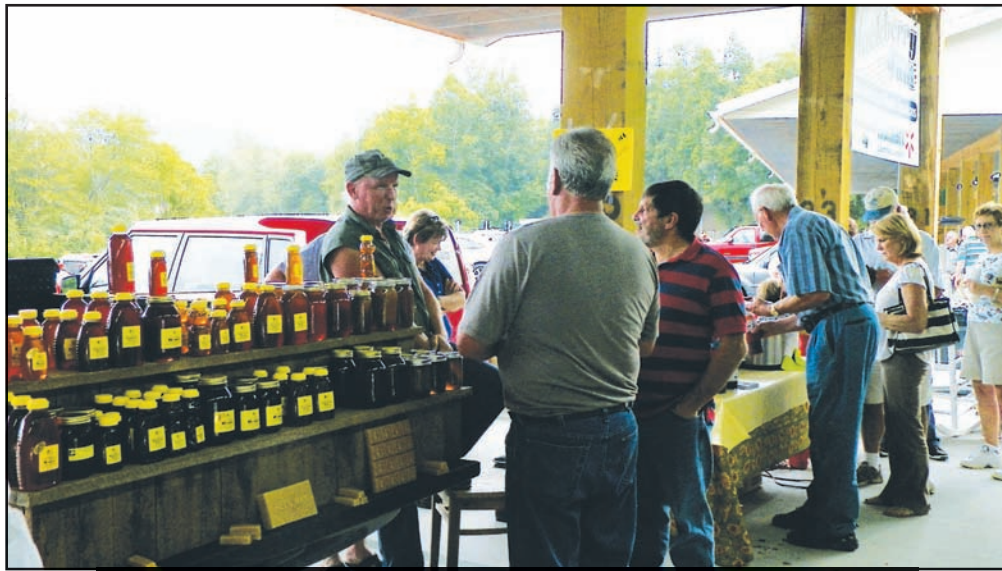
The first Foodie Night at the Union County Farmers Market was a rousing success as hungry locals flocked to the tasting event. Event organizers say the crowd turnout was larger than anyone expected.