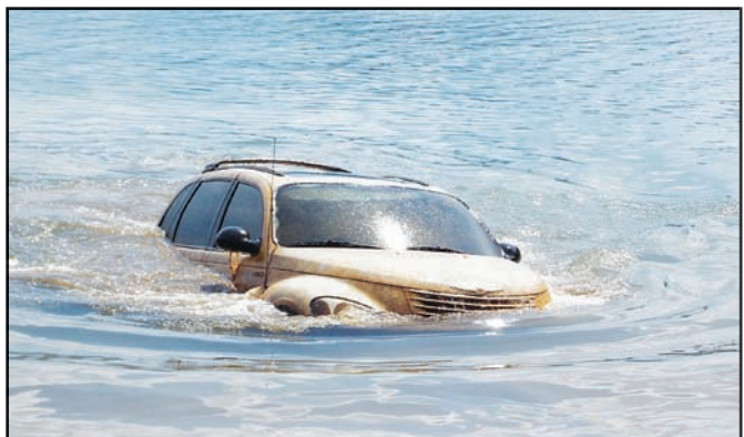
A white 2002 PT Cruiser resurfaces for the first time in several years. Union County Dive team members recovered two stolen vehicles last week from Lake Nottely.

The Dive Team waited until TVA began to pull