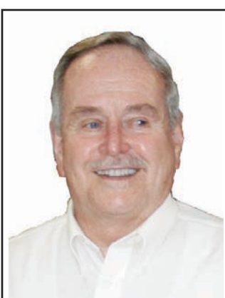
Mayor Jim Conley NC-based lender to assume control of those banks.

In March 2010, Citizens South took control of the Bank of Hiwassee, Bank of Blairsville, Bank of Blue Ridge and two branch banks as the Federal Deposit Insurance Corporation entered into a purchase agreement with the Gastonia,