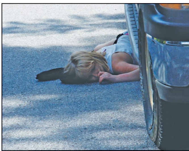
A victim lays underneath a Chevy Suburban unnoticed by emergency workers during a recent training exercise in Blairsville.