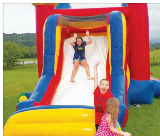
The Bounce House was a hit with local youth attending the Open House at Fire Station 2 in the Jones Creek Community.