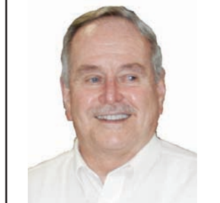
Mayor Jim Conley