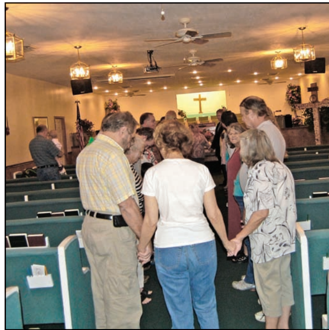
The Pine Top Baptist Church faithful pray for our nation on Sept. 11th during a ceremony at the church.