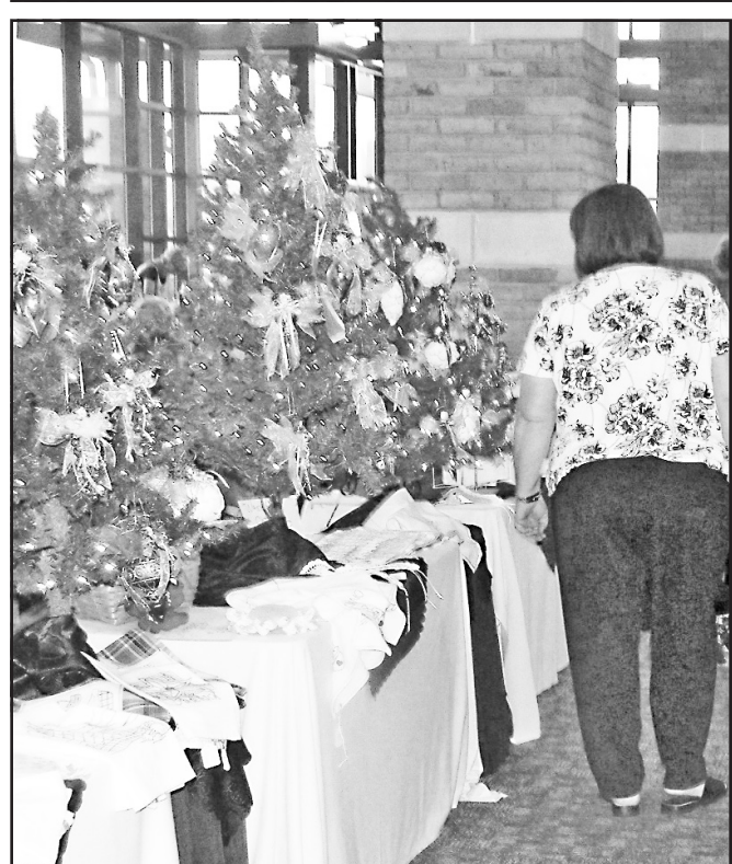
It was a good two days to shop at the First Celebrate Autumn Festival at North Georgia Technical College.