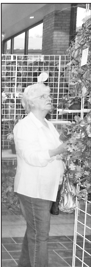
Decisions, decisions. Patrons had many incredible arts and crafts to choose from at the First Celebrate Autumn Festival at North Georgia Tech.