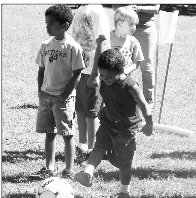
Kids at play is what it's all about at Let's Move! Day.

"We appreciate all of our sponsors who made this possible. Bi-Lo is here providing healthy foods, Young Harris