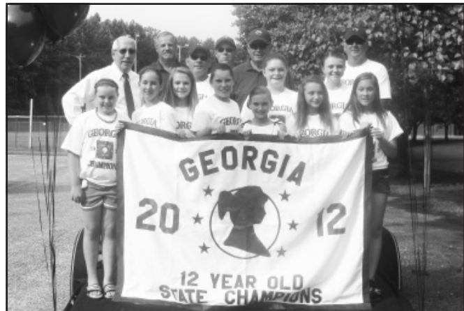
Union County's softball tradition continued with a state championship effort from the 12-U Girls.