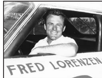
Fred Lorenzen in 1963