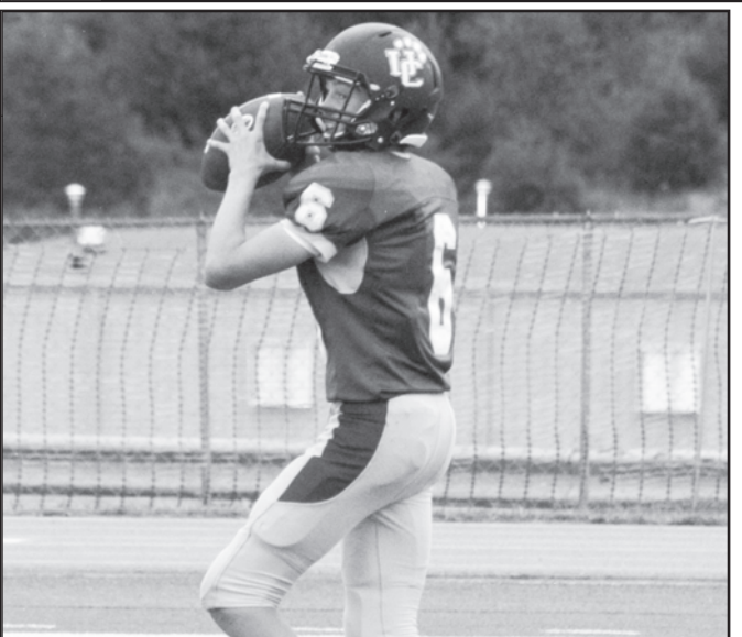
The Union County JV Panthers suffered a tough loss to Pickens County last week.