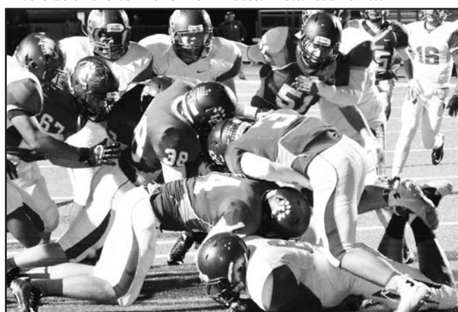
The Union defense just misses out on a safety as they stuff the Eagles rushing attack inside its own 1-yard line.

up on the Riverside quarterback, dropping him for loss of five, then a false start and a pair of incompletions brought up a 4th-and-20 and a punting situation.