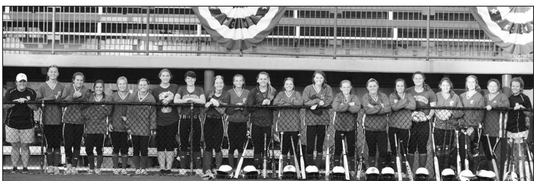
After ending a 5-year absence from the Elite 8 with only two seniors on the team, the Lady Panthers look to make a habit out of playing in Columbus every October.

In the early going the Lady Panthers got the jump on Seminole County and took a 2-0 lead after an inning. Unfortunately, the second inning would be all