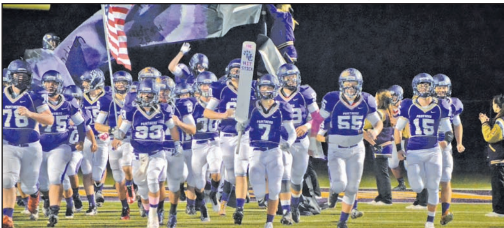
Panthers defeat Washington Wilkes to advance to State

But don't tell that to this year's crop of seniors. With First Team All State