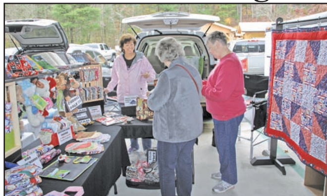
See Farmers Market, Page 3A

The next event at the Farmers Market will be the Kris Kringle Mountain Market,