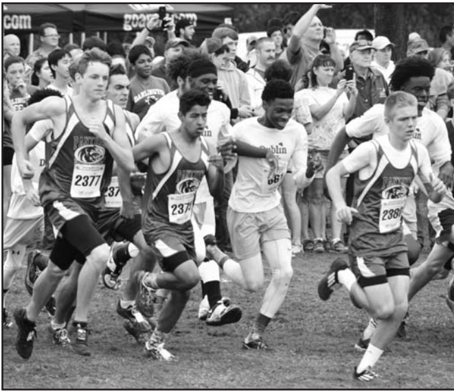
Union's guys at the starting line in Carrollton.