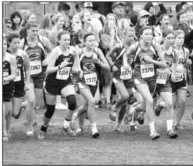
The Lady Panthers at the starting line in Carrollton.

ish of sixth was 46 points behind fifth place and 45 points ahead of seventh.