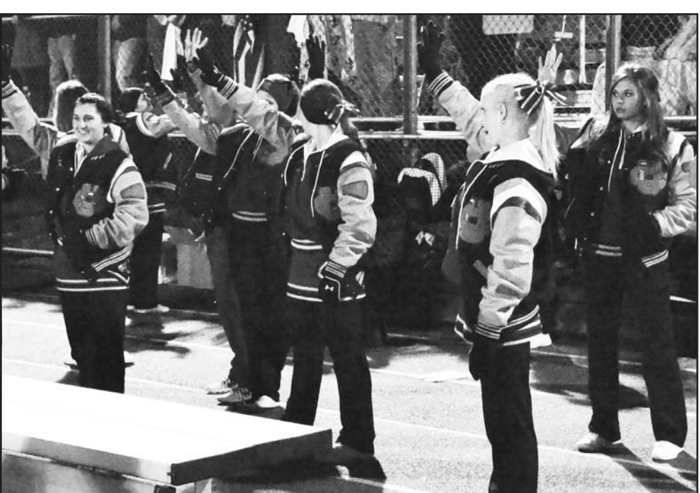
Union County Cheerleaders hold up four fingers to signal the fourth quarter.