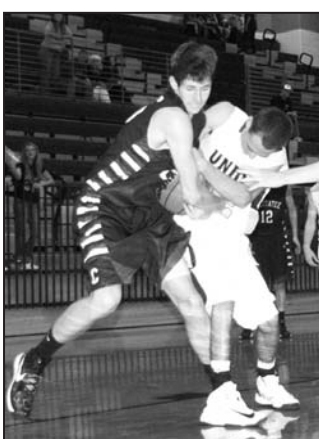
Coyne battles for possession.