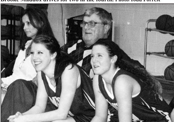
The Union bench realizing that victory is near.